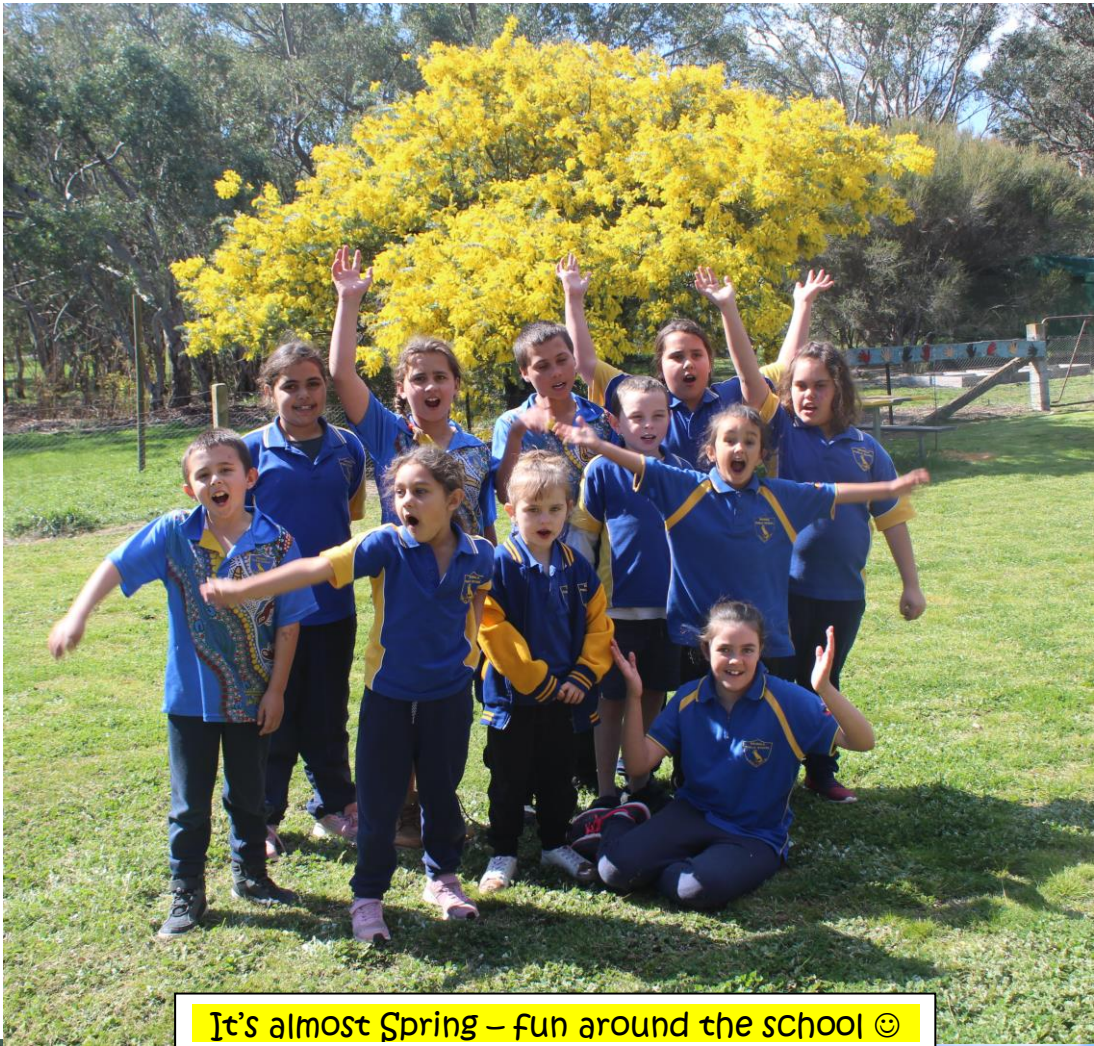
It's almost Spring – fun around the school 😊